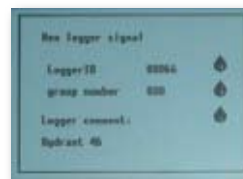
Status showing leak