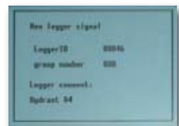
Status showing no leak