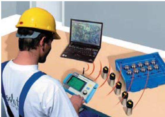
Reading and programming of loggers with radio link, analysis of data by PC